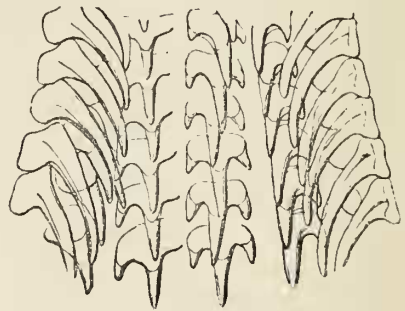
Fig. 3.— Ommastrephes volatilis sp. nov. camera drawing of radula, \times 60 .

The radula comprises seven series of somewhat thick teeth, the median tooth being tricuspid, the lateral bicuspid, and both the marginals unicuspid. The lateral teeth are about as long as the median, and the outer marginal a little longer than the combined length of the two succeeding medians (text-fig. 3).